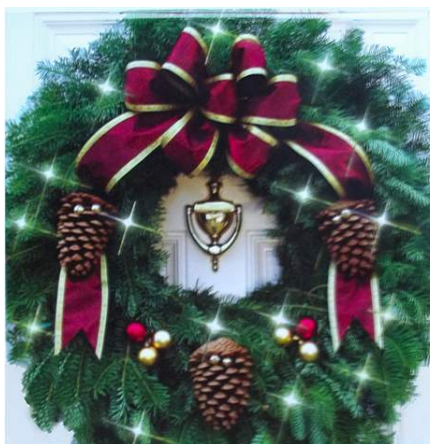
Christmas Wreath LAF Fundraiser Beautifully decorated 25 inch Victorian live balsam fir wreath. Cost is $26.