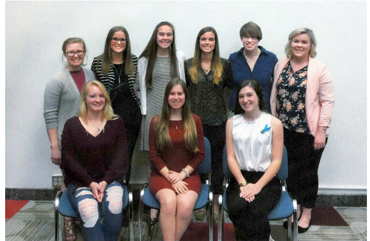
2018 Scholarship Winners